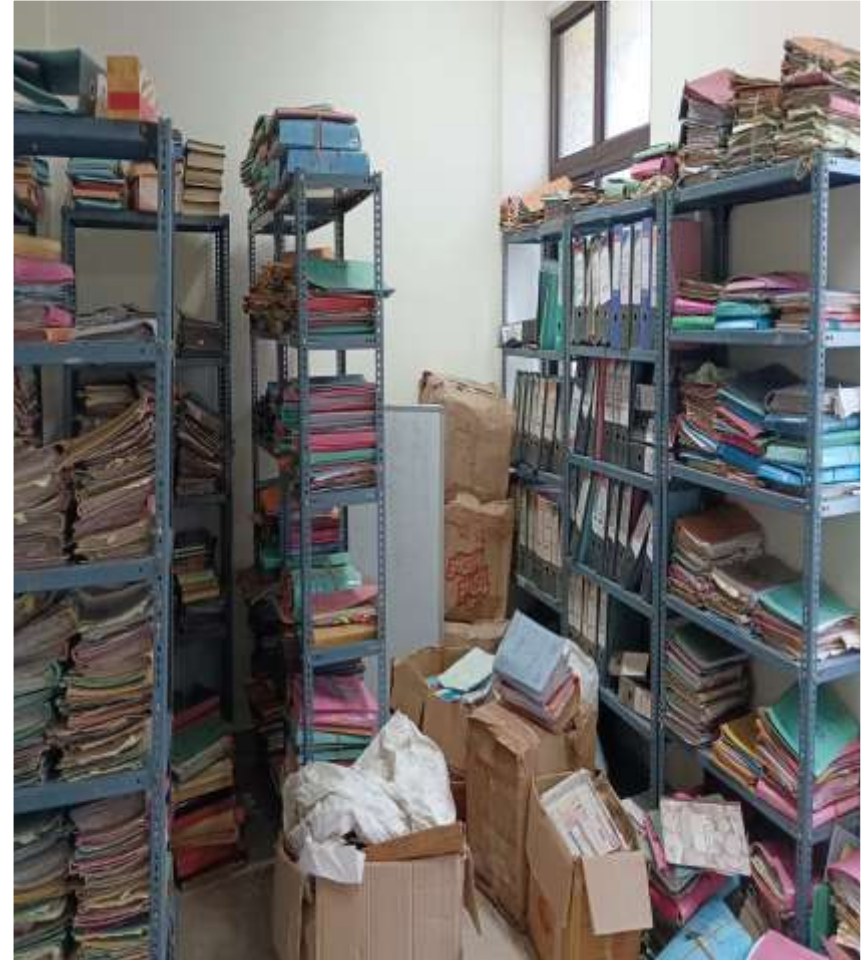
Shifting of RC Bhagalpur to RC Patna IGNOU REGIONAL CENTRE BHAGALPUR