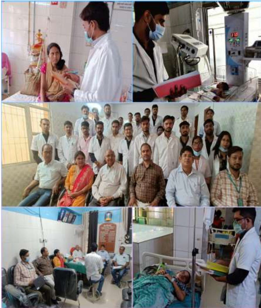
Term End Examination June 2022 CCH Practical