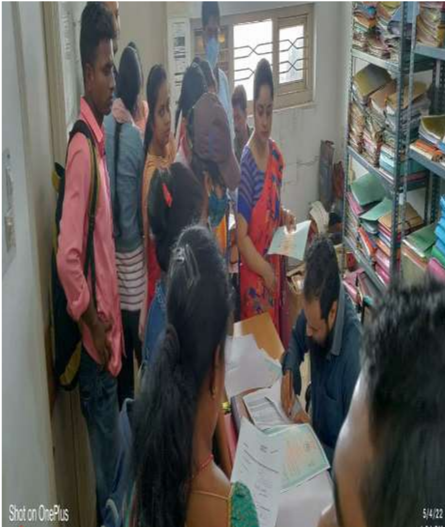
Distribution of Certificate