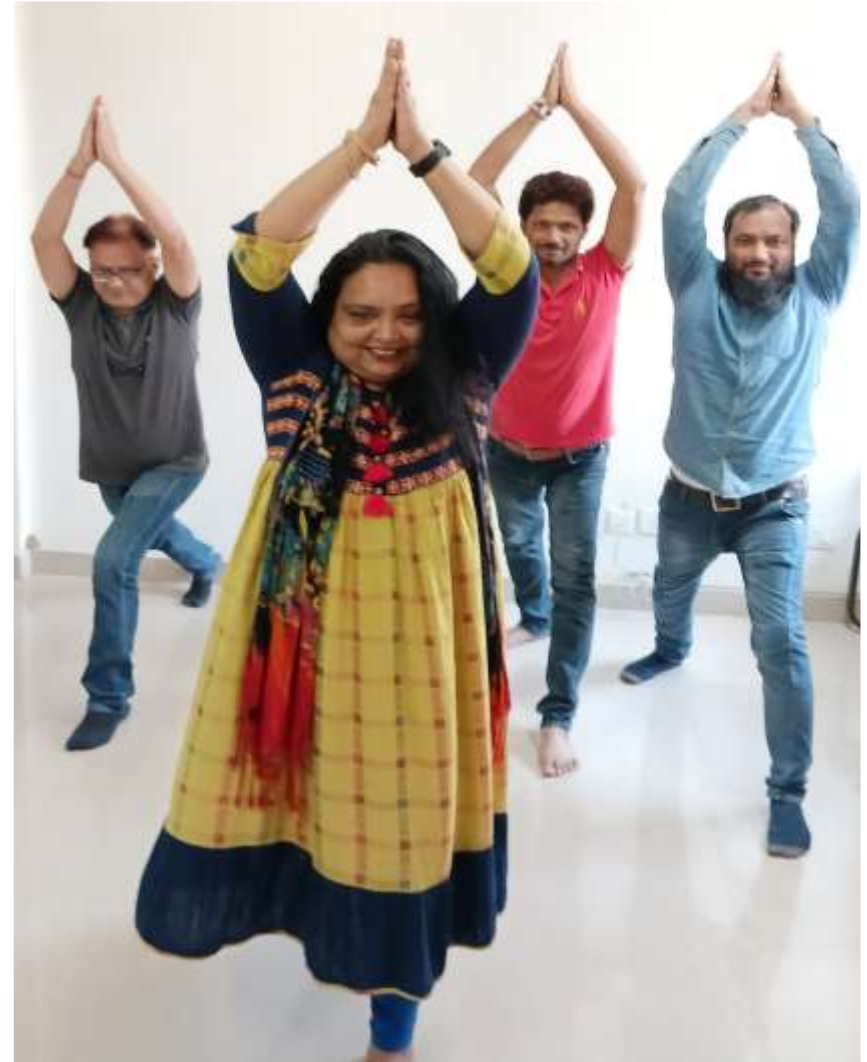
International Yoga Day IGNOU REGIONAL CENTRE BHAGALPUR