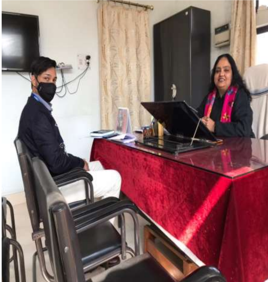
Meeting with JHPIEGO official for CCH Programme Coordination