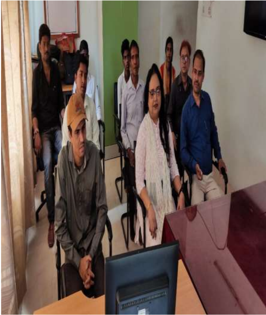
Pariksha Pe Charcha