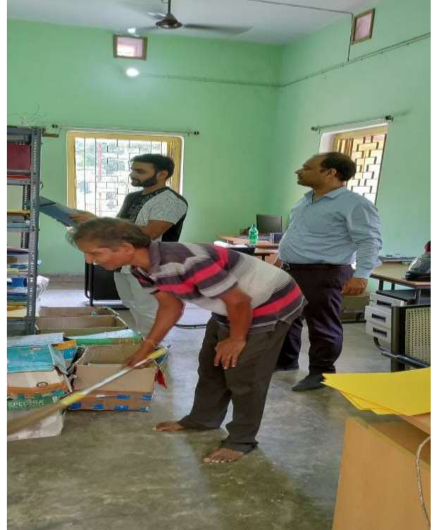
Swachhta Pakhwada at Bhagalpur