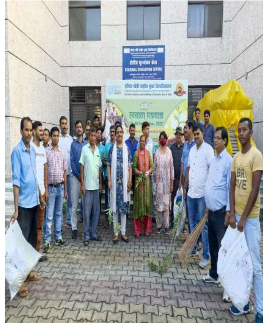
Swachhta Pakhwada at RC Patna IGNOU REGIONAL CENTRE BHAGALPUR